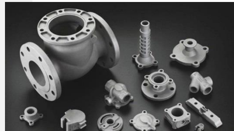
PUMP AND VALVES