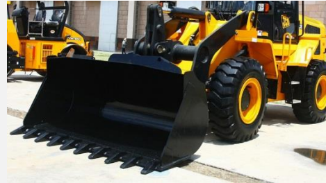
EARTH MOVING PARTS