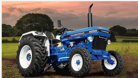
AGRI EQUIPMENT COMPONENTS